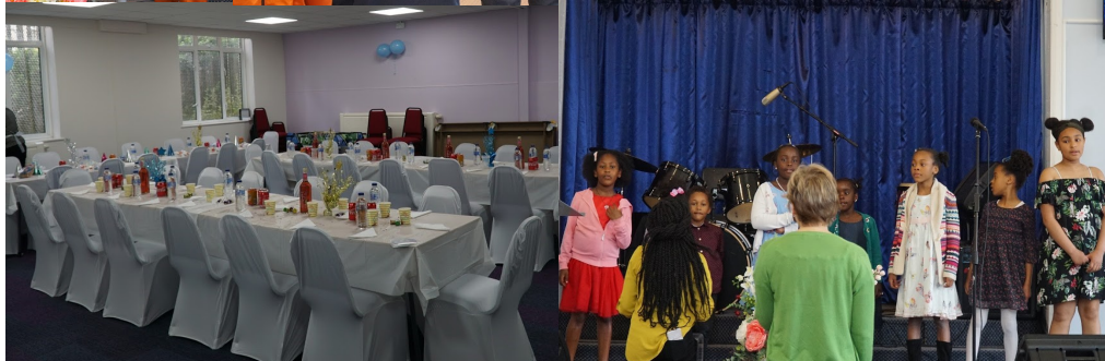
KTLC South Men's Breakfast